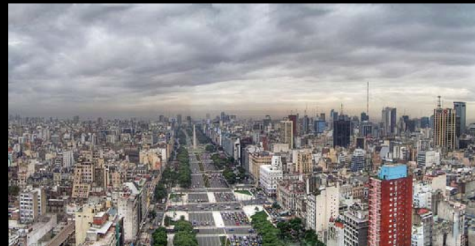
Buenos Aires 2010