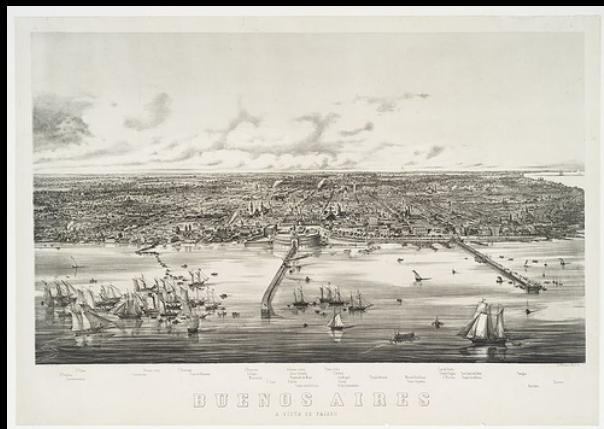
Buenos Aires 1860